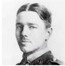
Both CRW Nevinson's La Patrie (1916, right) and Anthem For Doomed Youth by Wilfred Owen, above, express the outrage and shame these artists felt at the violent disregard for young lives which they experienced at first hand. Owen's original manuscript survives, below. It was his friend Siegfried Sassoon who suggested changing the title to 'Doomed'

Always they must see these things and hear them, Batter of guns and shatter of flying muscles, Carnage incomparable, and human squander Rucked too thick for these men's extrication. Therefore still their eyeballs shrink tormented Back into their brains, because on their sense Sunlight seems a bloodsmear; night comes blood-black; Dawn breaks open like a wound that bleeds afresh. – Thus their heads wear this hilarious, hideous, Awful falseness of set-smiling corpses. – Thus their hands are plucking at each other; Picking at the rope-knouts of their scourging; Snatching after us who smote them, brother, Pawing us who dealt them war and madness.